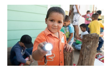
Flashlights packed in shoebox gifts (with extra batteries) help introduce children to Jesus, the Light of the World.